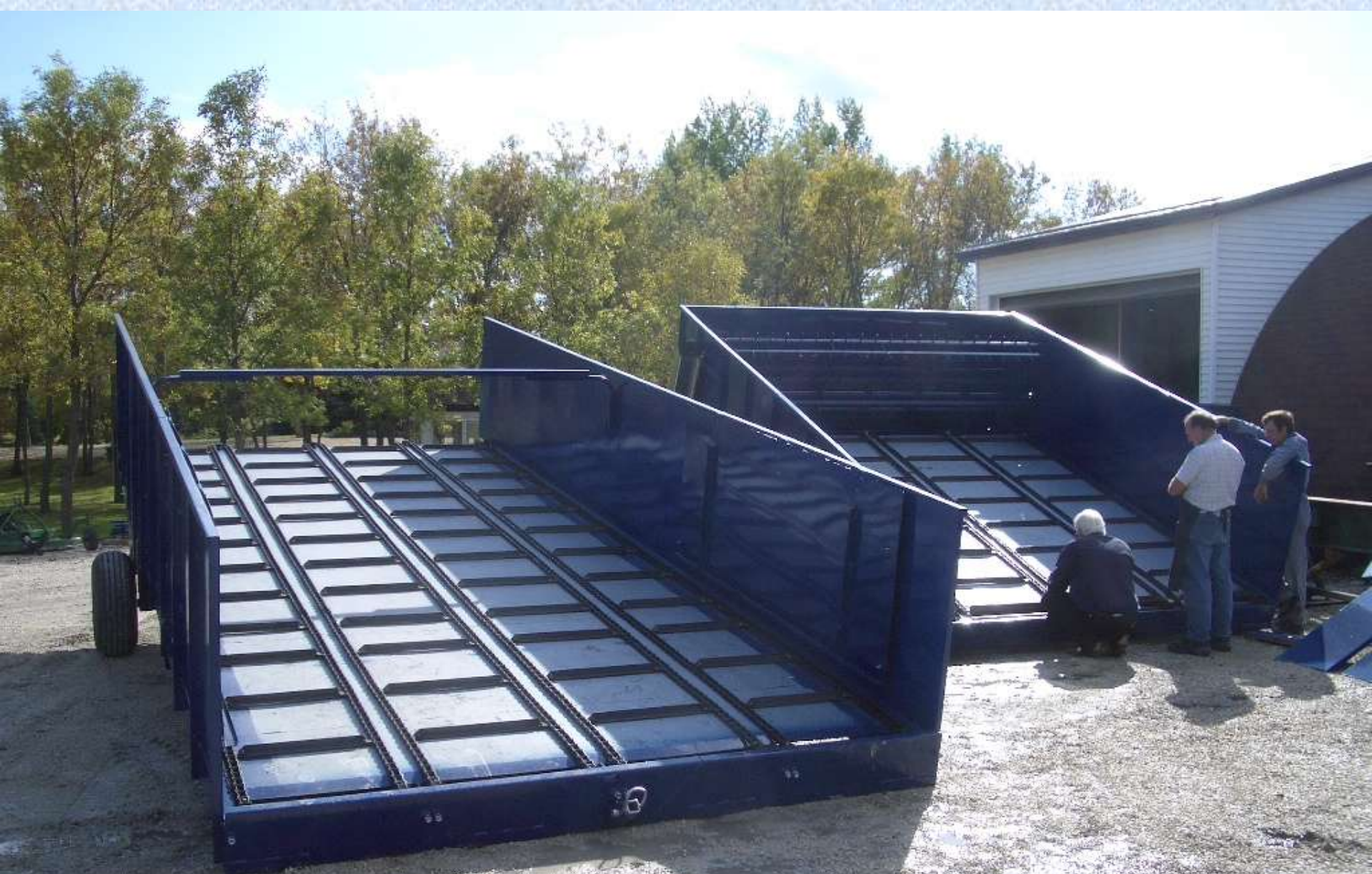
Two Stage Deck System/Unload over 150 tons /hour