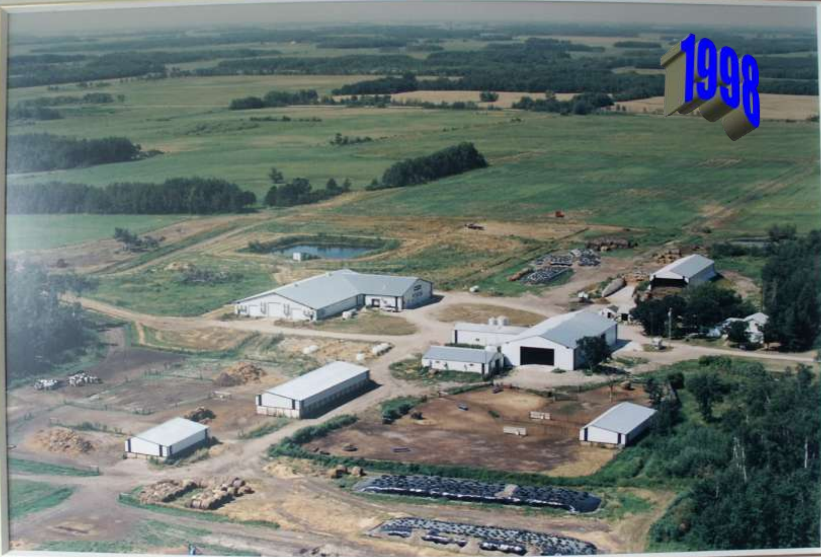
• FREEDOW DAIRY - 1998 •